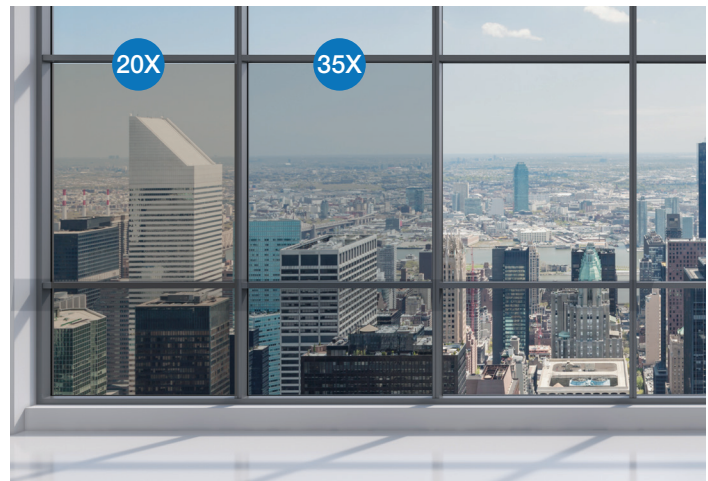
DS Bronze 20X

This image has been simulated and is not actual product comparison