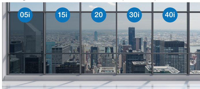
DR OptiTune 05i | DR OptiTune 15i | DR OptiTune 20i | DR OptiTune 30i | DR OptiTune 40i

This image has been simulated and is not actual product comparison