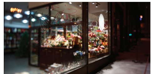
Clear Poly X