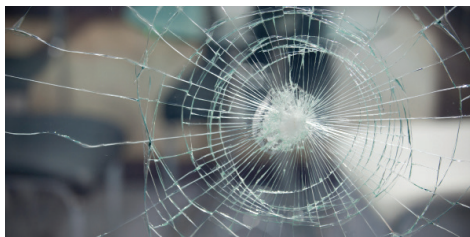
SF Clear X